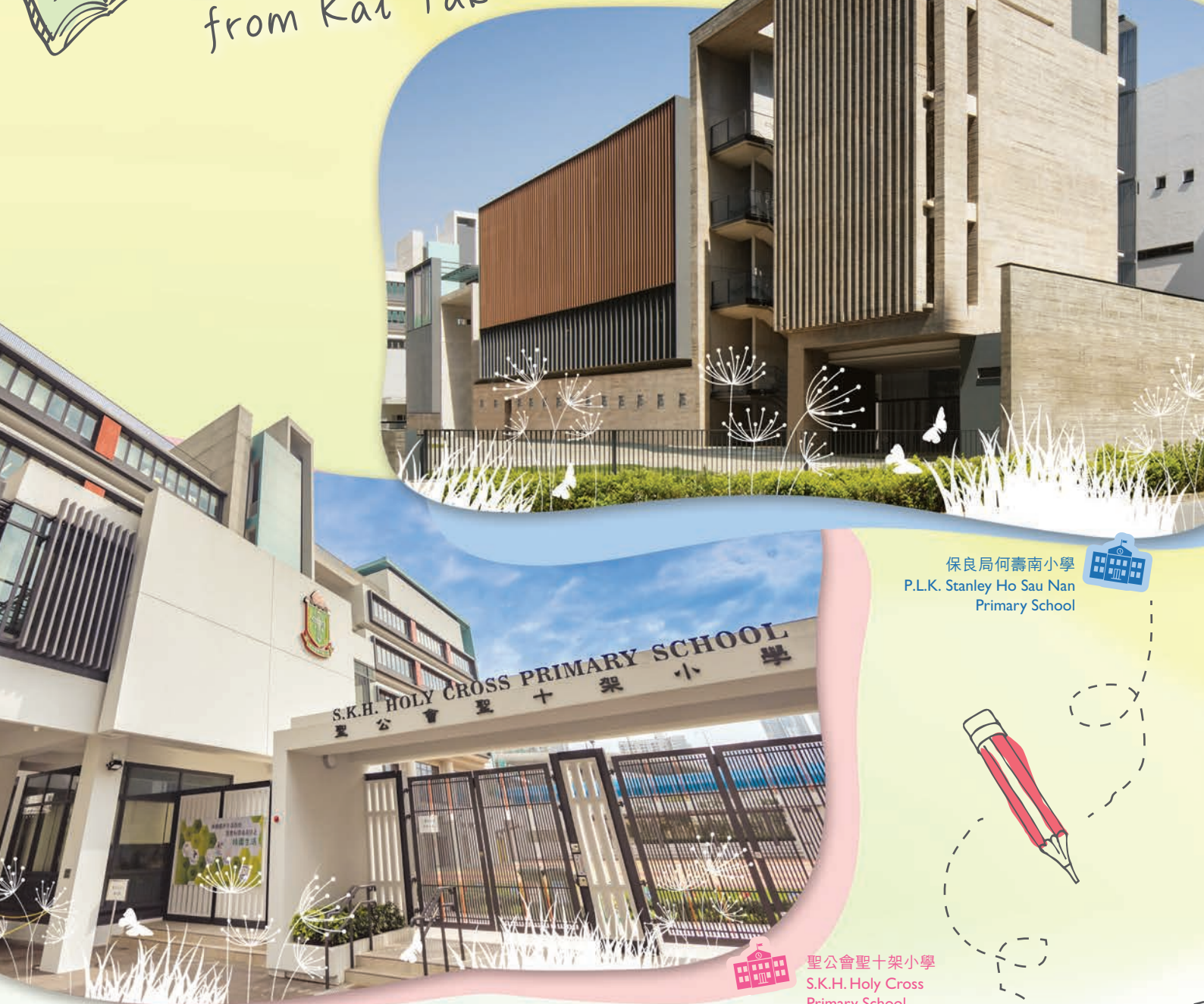
保良局何壽南小學 P.L.K. Stanley Ho Sau Nan Primary School