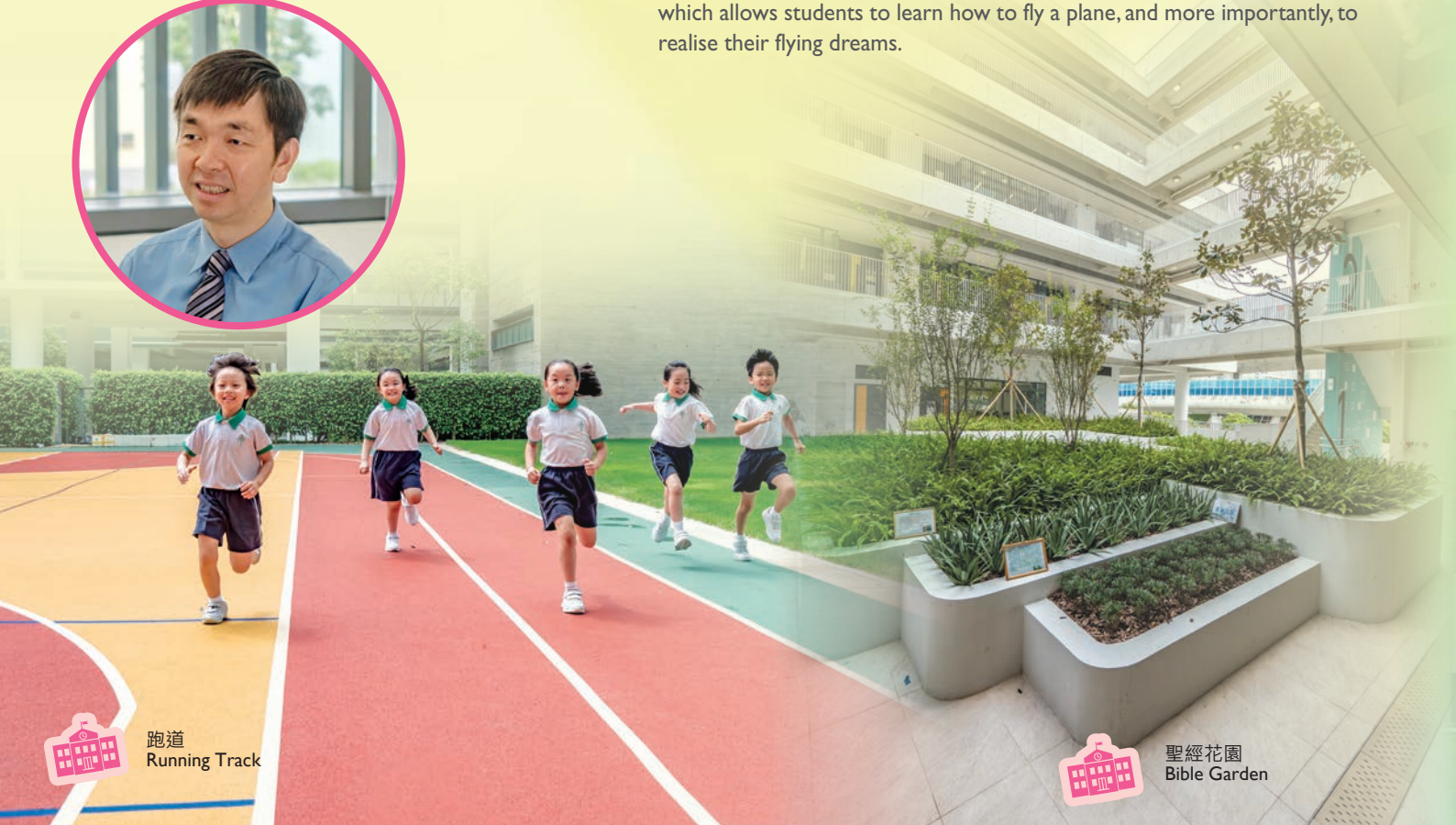
跑道 Running Track