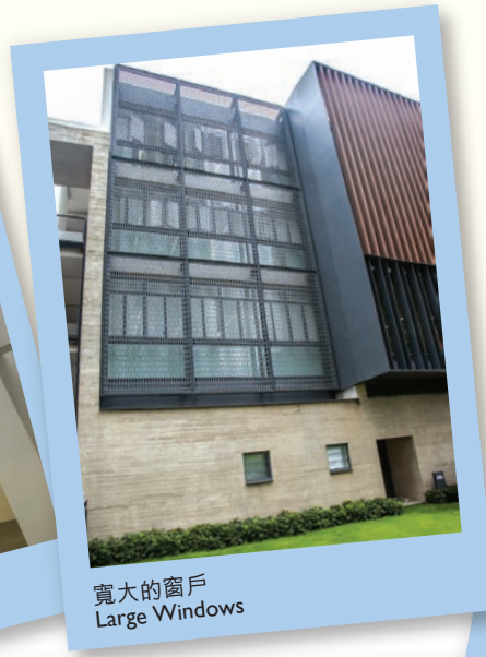
寬大的窗戶 Large Windows