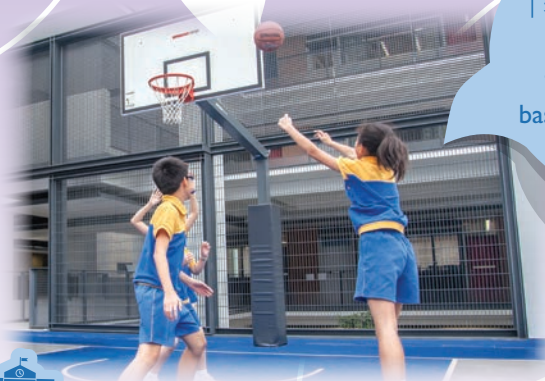
中央籃球場 Central Basketball Courts

「我們很喜歡這裏的新籃球場。」 “We like the new basketball courts here very much.”