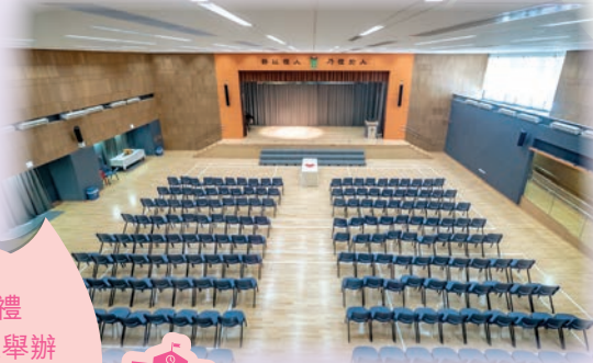
禮堂 Assembly Hall

“There was no standard assembly hall in our old school. The new assembly hall allows us to hold many different activities.”