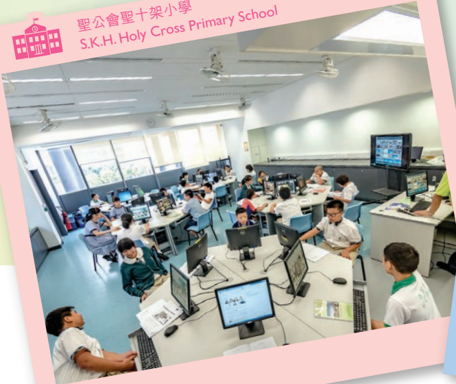
電腦室 Computer Room