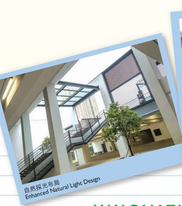
自然採光布局 Enhanced Natural Light Design