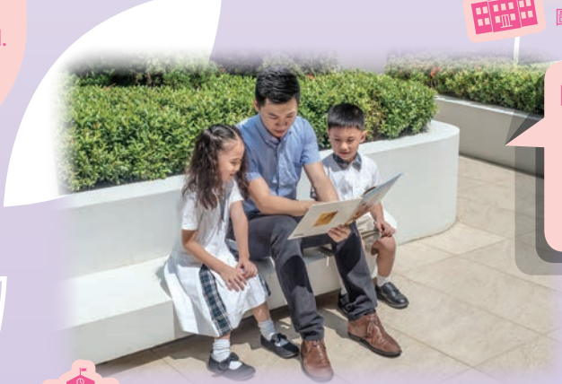
中庭花園 Central Courtyard

「可以在戶外學習，讓我們覺得課堂變得更有趣味。」 “Learning outside the classroom makes lessons become more interesting.”