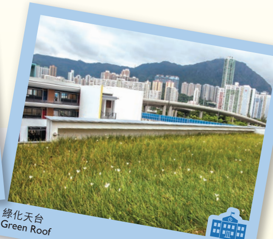
綠化天台 Green Roof