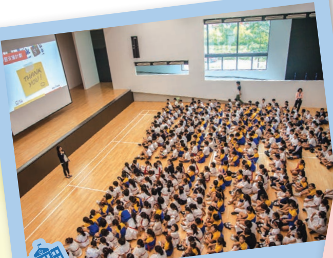
禮堂 Assembly Hall

Our aviation history might start from just one whimsical idea. Though we no longer see flights taking off and landing at Kai Tak anymore, with the two newly completed primary schools in Kai Tak, it is still a place where countless young dreams set sail.