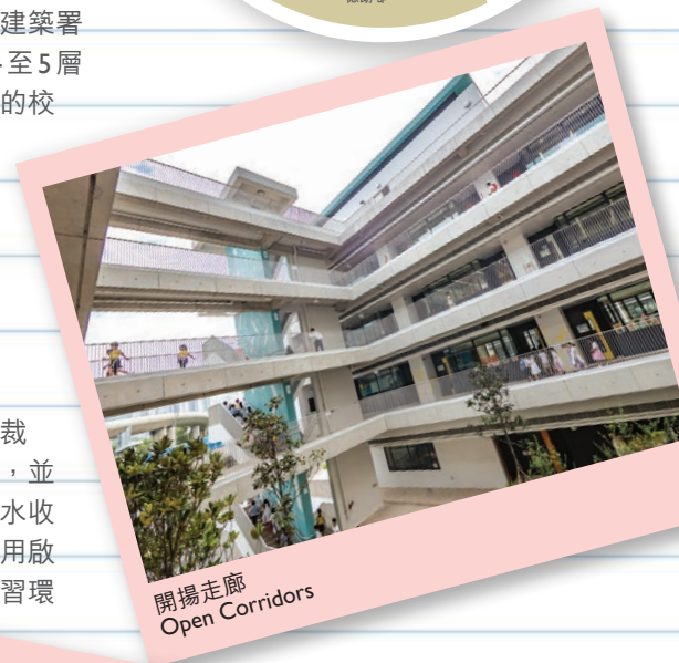
開揚走廊 Open Corridors