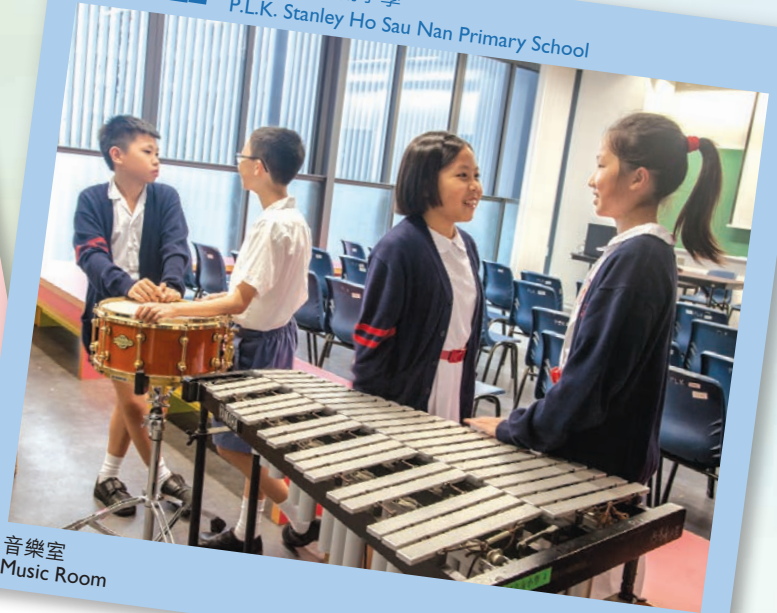
音樂室 Music Room

回想起小時候仍是小學生的你，可曾想過日後要成為飛機師、工程師、老師、運動員、鋼琴家，又或是醫生？校園是啟發學生、成就夢想的地方，同學們總有着各式各樣的大志向和理想，以小小的眼睛看花花世界，啟發出大大的夢想。