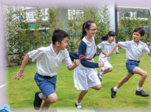
圖書館外綠化地 Green Area outside Library

「學校到處都是綠色植物，令我們覺得更貼近大自然。」 “Greenery is everywhere and we feel closer to the nature.”