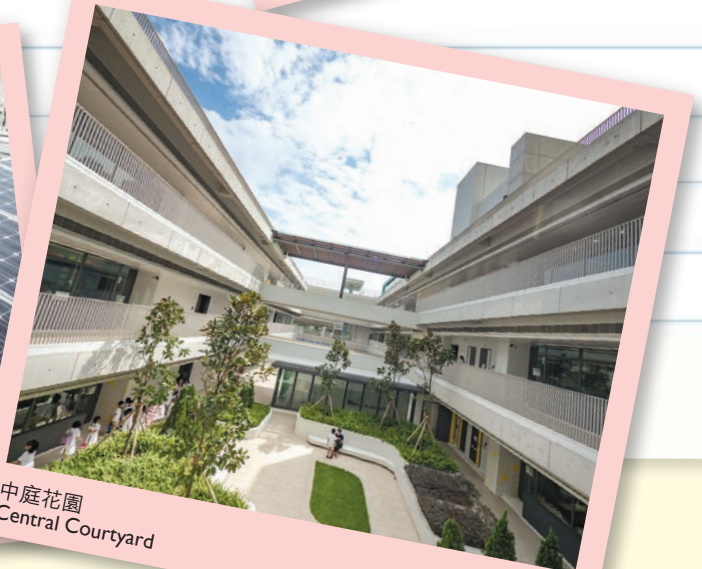
中庭花園 Central Courtyard